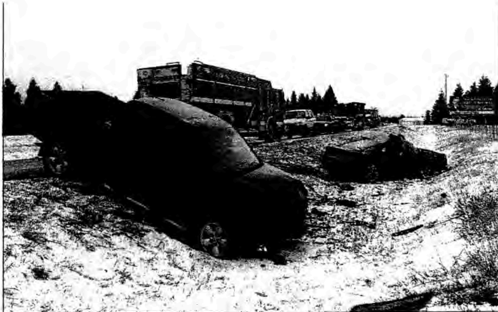
A WOMAN died in this two-vehicle collision Thursday morning on Montana 206.