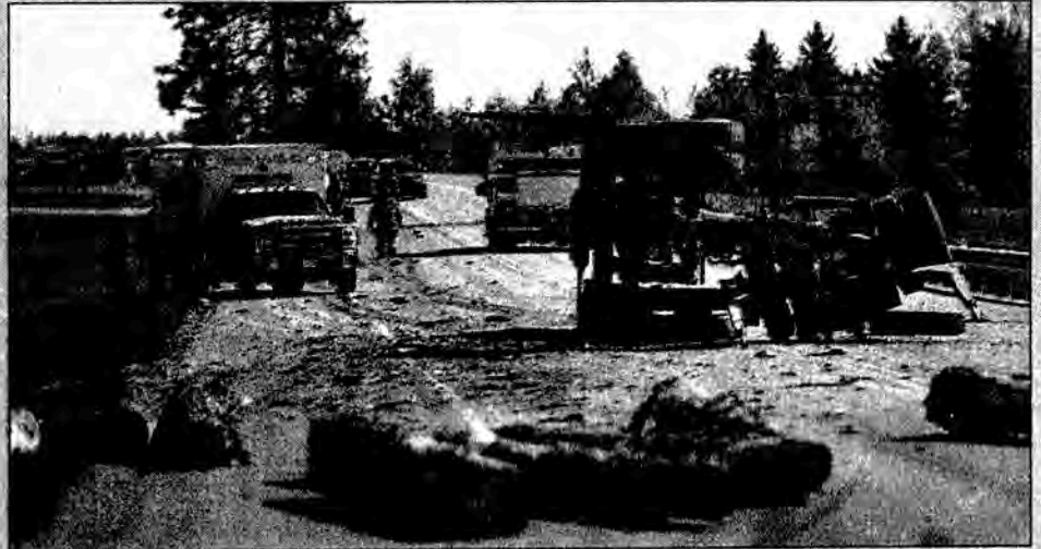
A FATAL wreck involving a pickup truck and a logging truck spread across Montana 35 near Creston on Thursday afternoon.

Emergency responders were dispatched to highway marker 38 on