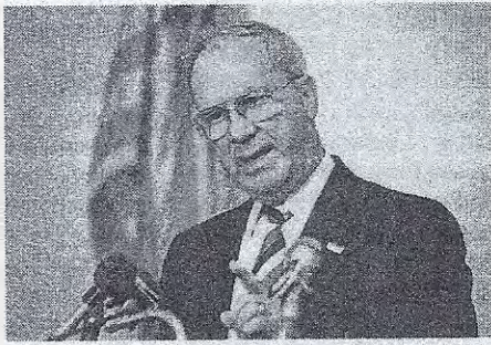
FORMER MONTANA Gov. Stan Stephens is seen in this Feb. 25, 1991, photo. Stephens died Saturday in Kalispell at the age of 91 after several months of ill health.