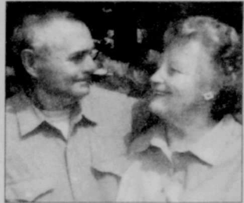
The Glaziers reside at their ranch in the Boorman community.