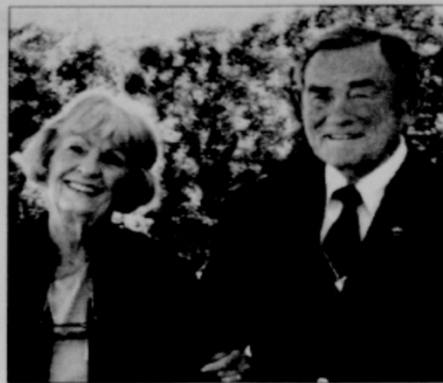
The Greaves pose for a 65th anniversary photo.