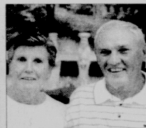
THE HAMILTONS celebrated their golden anniversary with a reception at Easthaven Baptist Church.