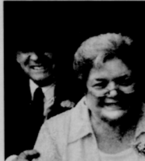
A SPECIAL dinner was held to celebrate the Blevins' golden anniversary.