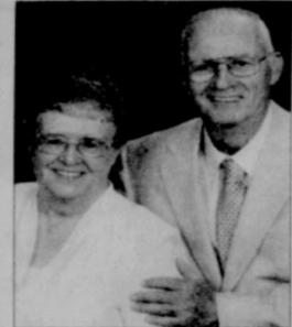
THE LAKES are celebrating 50 years of marriage.