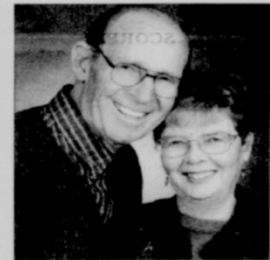
THE IVEYS recently celebrated 50 years of marriage.