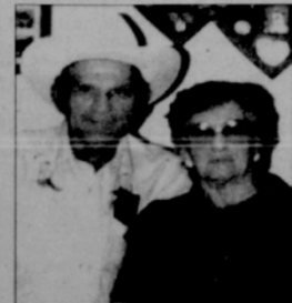
THE KRAUSES have been married for 50 years.