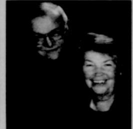
AN OUTDOOR garden party was held in honor of the Albright's 50th anniversary.