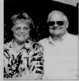
THE HOLMS are celebrating their 50th anniversary on June 22.