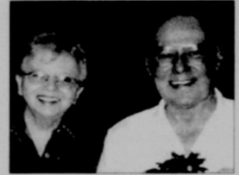
THE ELAMS recently celebrated 50 years of marriage.