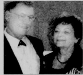
THE SLACKS will celebrate their golden anniversary on July 13.