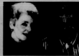
THE OSTROMS recently celebrated their 50th anniversary.