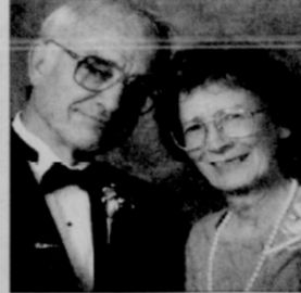
THE GUYS recently celebrated their 50th anniversary.