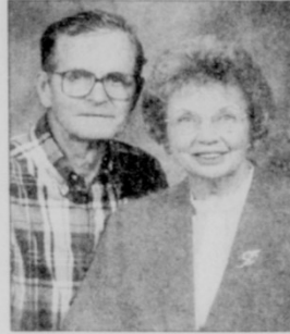
THE HEGLANDS celebrated their 50th anniversary by attending their granddaughter's June 19 wedding.