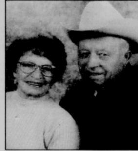
THE LYNCHES marked 50 years together with a reception for over 200 at their home.

Bess attended schools in Kalispell, graduating from C & C