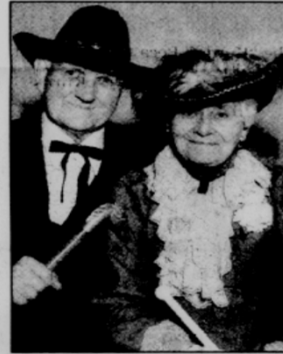
THE AURANDS, shown here in a western-style photo studio, say their belief in God and good communication have made their marriage last.

Columbia Heights. A lasting marriage needs to include the presence of God, said Peggy. The couple attends First Christian Church in Columbia Falls. "You have to have God in