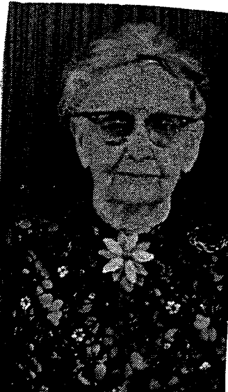
The marriage ceremony took place while the bride and groom were on horseback. Her husband was a farmer and engineer on the Chicago-Milwaukee Railroad.

The family suggests memorials to Immanuel Lutheran Home or to the John Bartlett Scholarship Fund, c/o the University of Montana, Missoula.